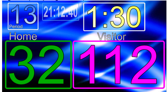
'Near end of game' scoreboard: Countdown, scores, realtime clock