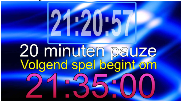
Interval messages & realtime clock